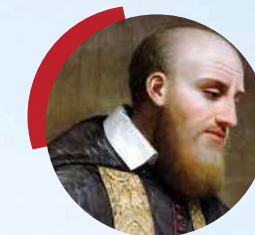
St. Francis De Sales Our Patron